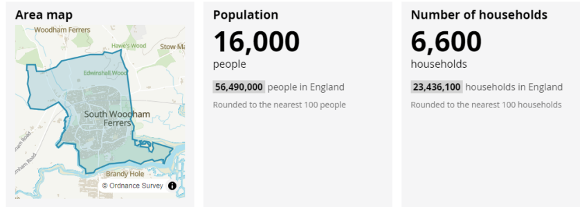
Figure 1 https://www.chelmsford.gov.uk/your-council/data-and-statistics-about-chelmsford/parish-tier-profiles/south-woodham-ferrers/